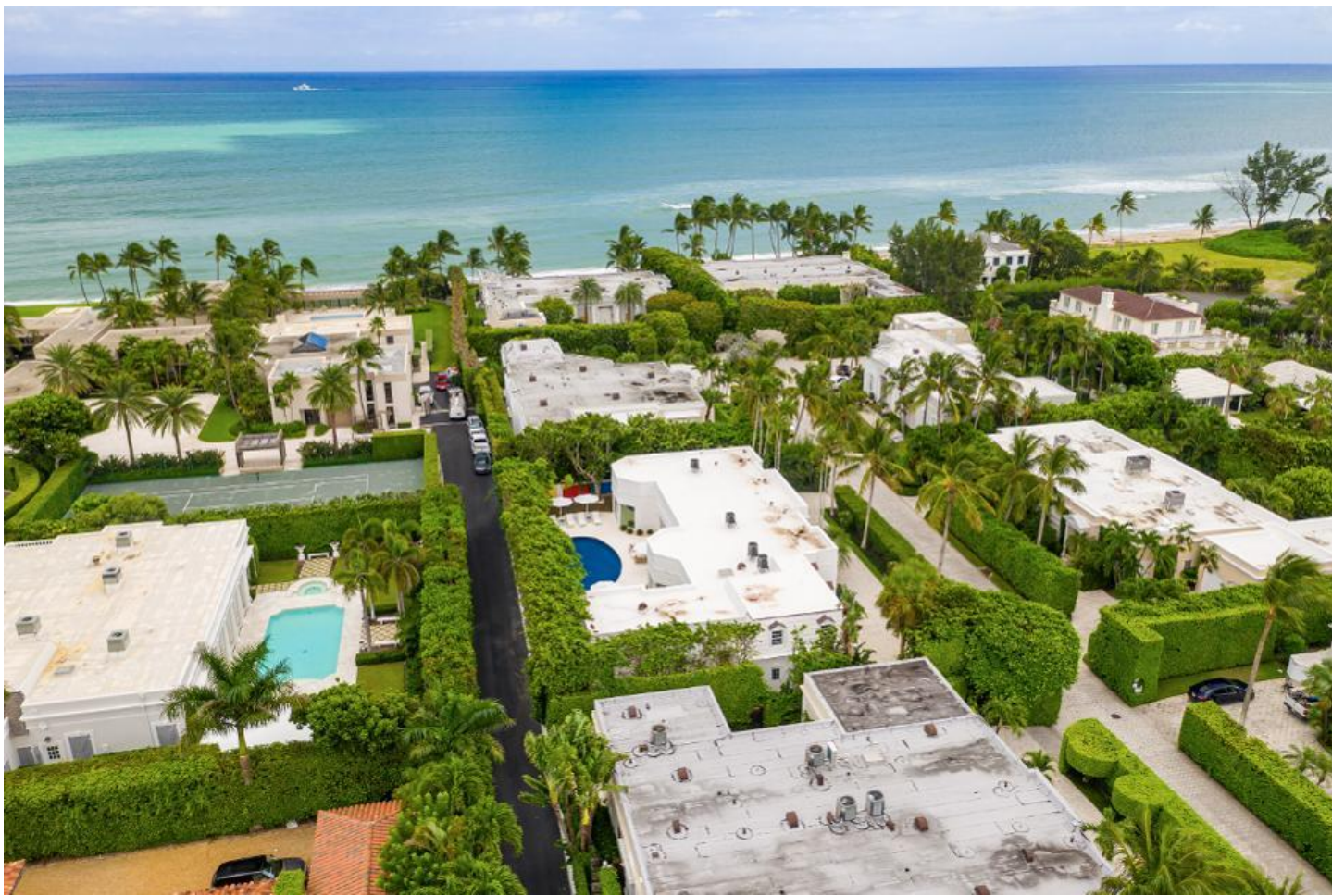
The secluded Regency estate, 3 Via Los Incas (center), is two blocks from the ocean.