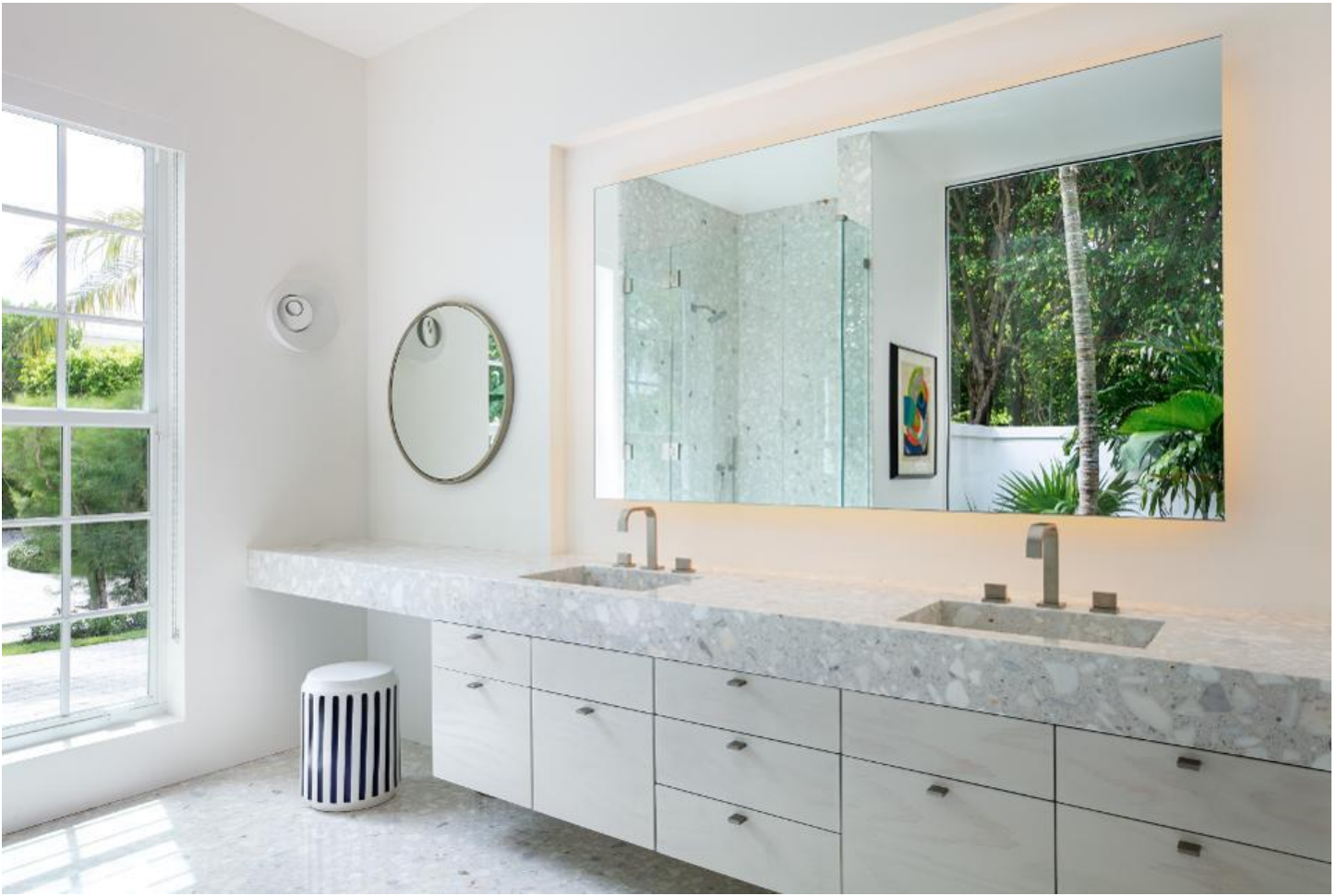
The home has six-and-a half baths

In the future, Minkoff predicts people will entertain with more “charity barbecues than galas and balls.” Regency’s recall a bygone era of sentimental sophistication. But the estates remain prized.