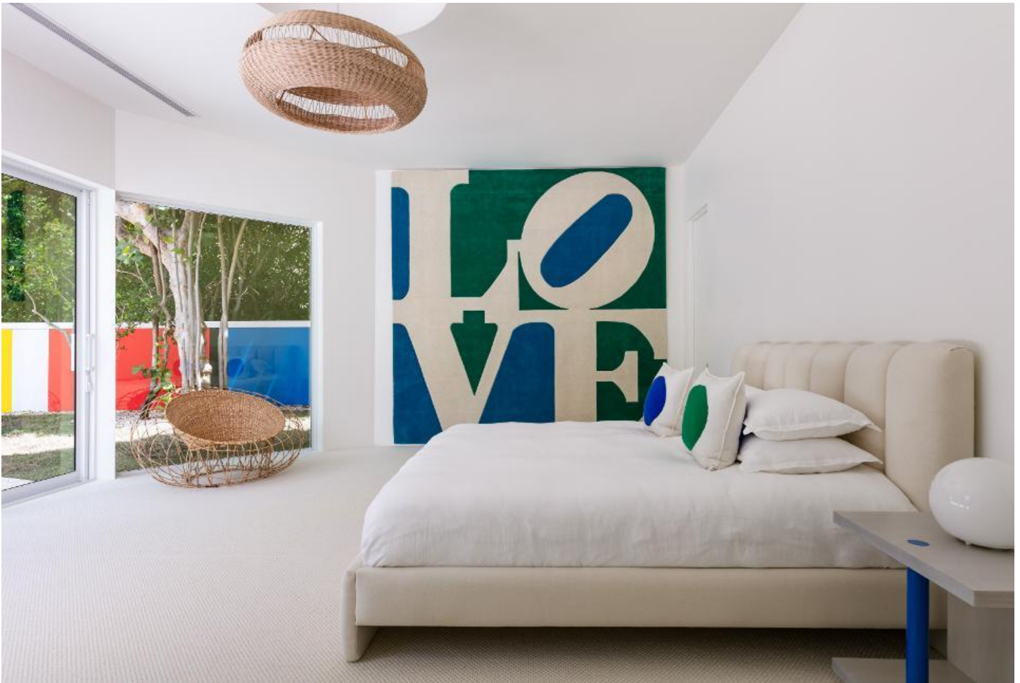
Palm Beach Island's 3 Via Los Incas residence offers six bedrooms and six-and-a-half baths.

The appeal of Regency's changed through the decades, as new generations redefined affluent housing. Summer Baby Boomers in the Hamptons led more casual lifestyles, ditching sapphires, ball gowns, ties and tuxedos in favor of pricey shoes, accessories and watches with jeans.