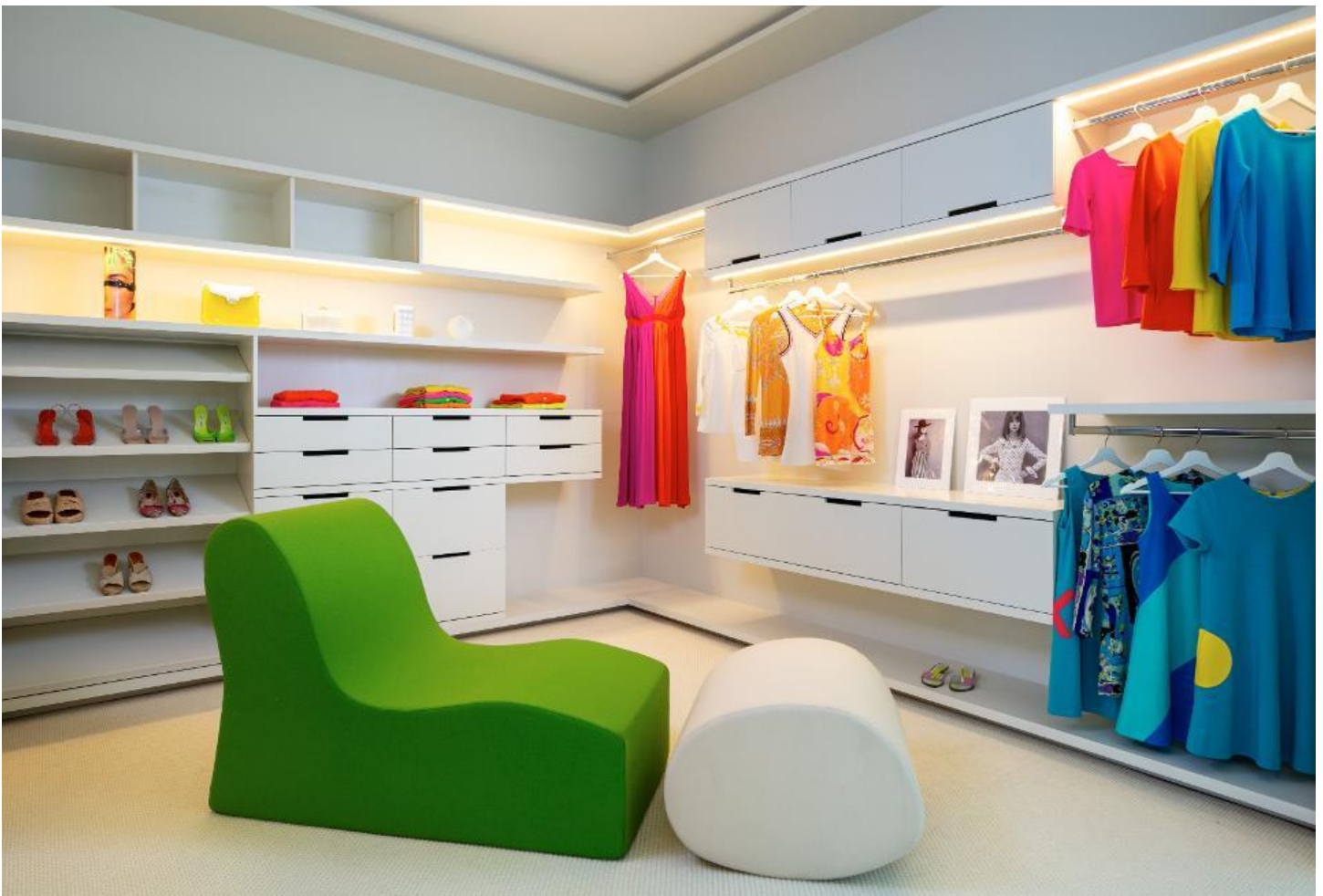
Vibrant walk-in boutique closet

“It is safe to say that circles and dots are a running theme throughout my homes and my life,” she says. “Each time I see them, the positive impact is immediate, and they make me smile.”