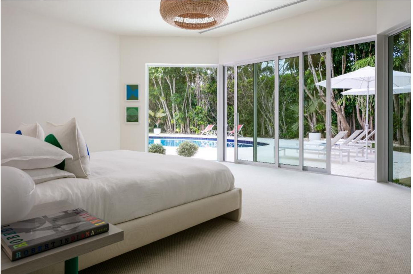
The house is listed for $10.9 million.

“Regency's were a very glamorous style of architecture which was popular in the late 1950's through the early 1980's,” says Minkoff. “They took their design aesthetic from British architecture in the late 19th Century. Think Regent Place, Eaton Square. Bob Gottfried developed some of the best and most coveted Regency's.”