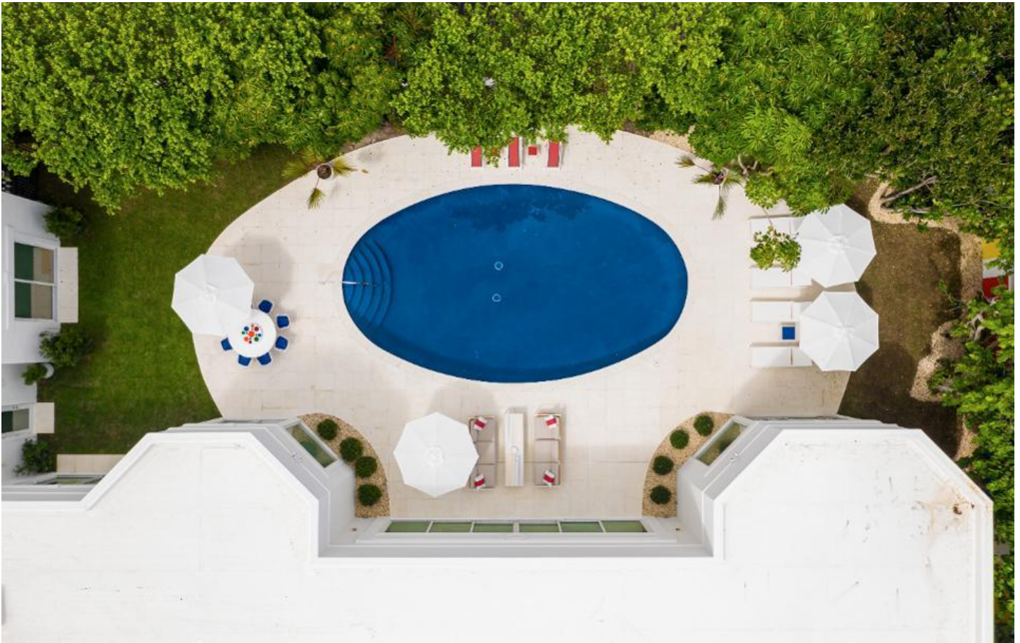
Oval pool backyard patio 2019

“Regency's were popular in Los Angeles too,” says Minkoff. “The Palm beach lifestyle used be far more formal and grand. People dressed for dinner and entertained formally. The furnishings were more traditional and the windows were swathed in drapes. Today's generation doesn't want that.”