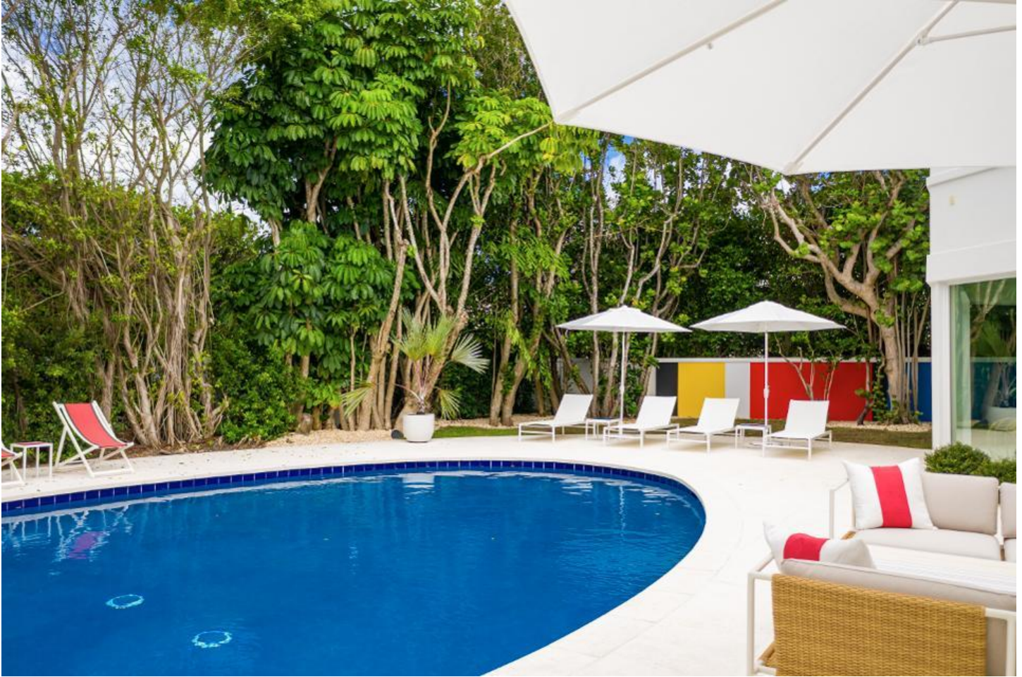
Oval pool backyard patio

The bright white kitchen and dining area are offset by vibrant color splashes. Sliding glass doors reveal the backyard patio pool with primary color fencing, umbrella loungers, and a modern polished chrome handrail arcing as an open invitation to take a dip.