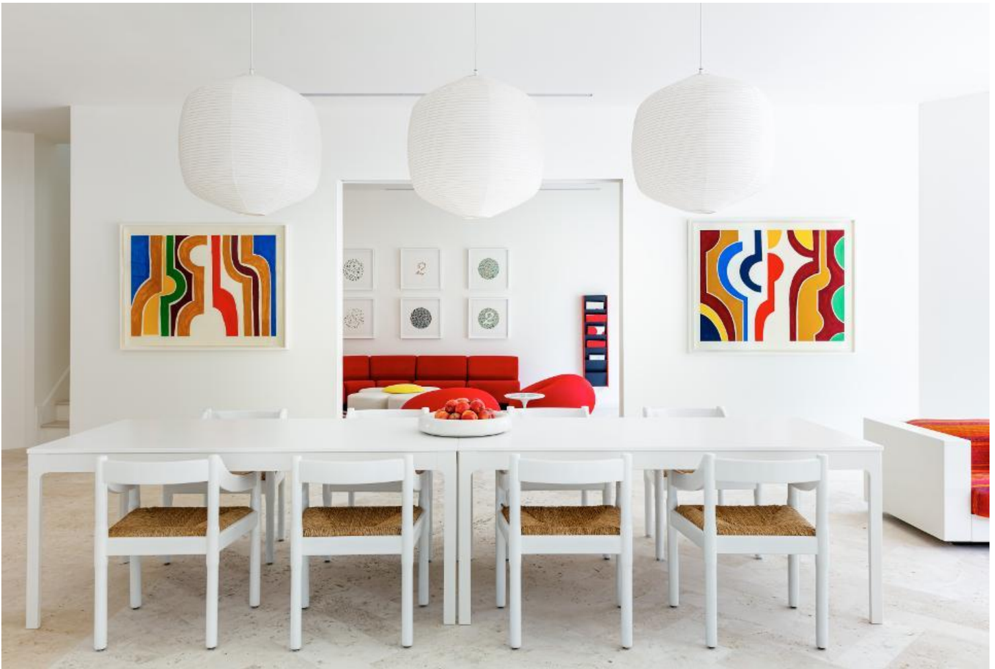
The juxtaposition of a bright white palette and splashes of color pops like a great work of art.

Just three houses from the ocean, the secluded residence sits along a private stretch of 10 Regency estates—seven include deeded beach access. This street dead-ends with two oceanfront houses, one of which was owned by the second wife of pre-Castro Cuban president Fulgencio Batista. The 3 Via Los Incas house has only had two prior owners.