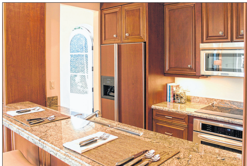
A pass-through bar between the living room and the kitchen serves as an informal dining area. The kitchen features mahogany cabinetry, granite countertops and stainless-steel appliances.