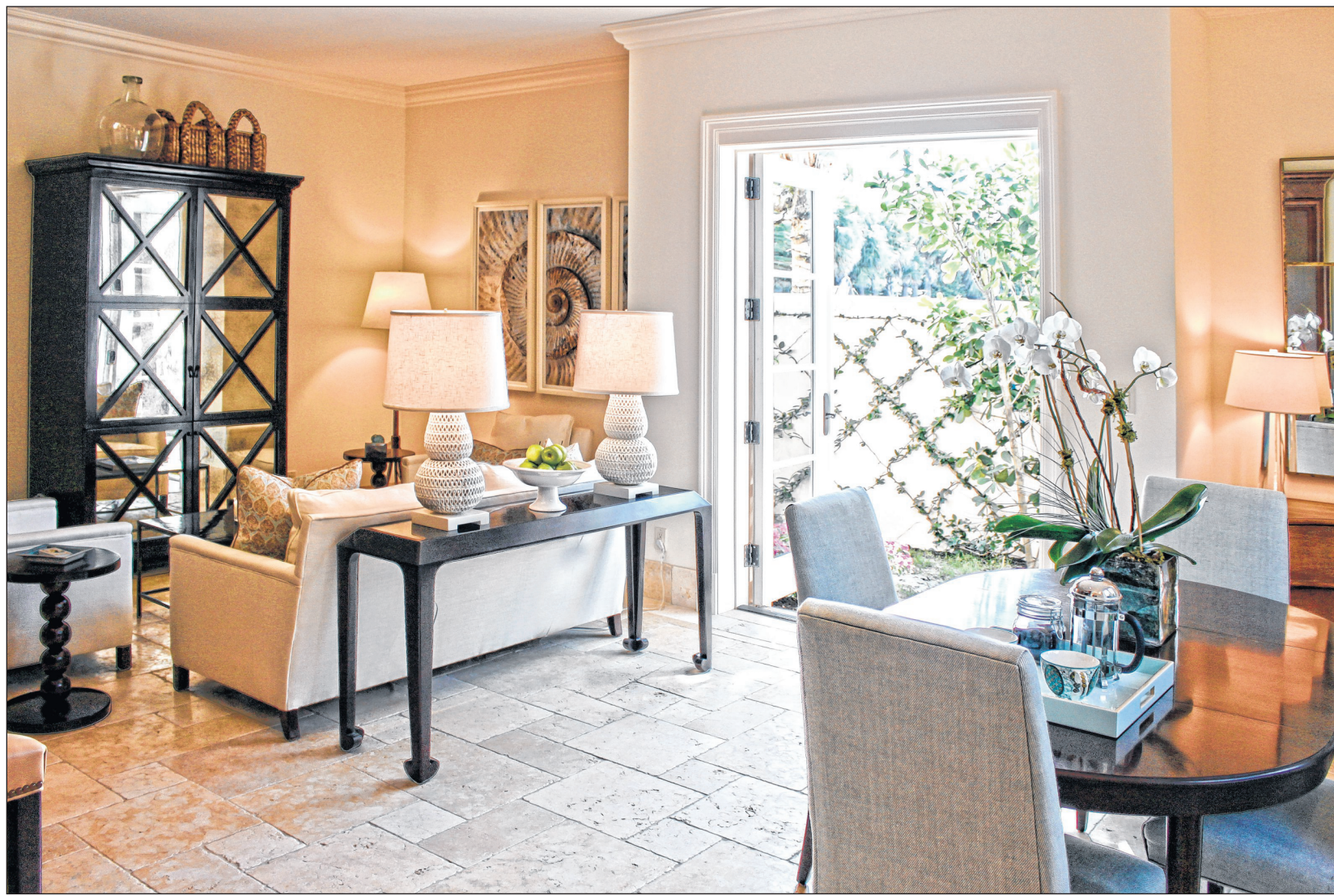
French doors in the living and dining area of the front Ocean Colony condominium unit at 129 Hammon Ave. open to a courtyard garden. The unit has been furnished to serve as a model for the development. The four condos and an accompanying townhouse have been listed for sale by the Corcoran Group.