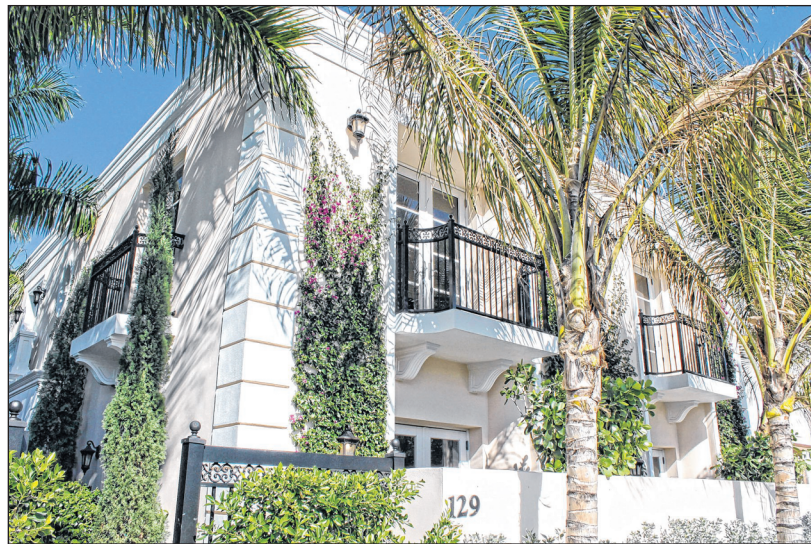
Built in the British Colonial-style by The Cury Group, a new condominium building at 129 Hammon Ave. is part of the Ocean Colony development. It stands on an ocean block within walking distance of Worth Avenue.